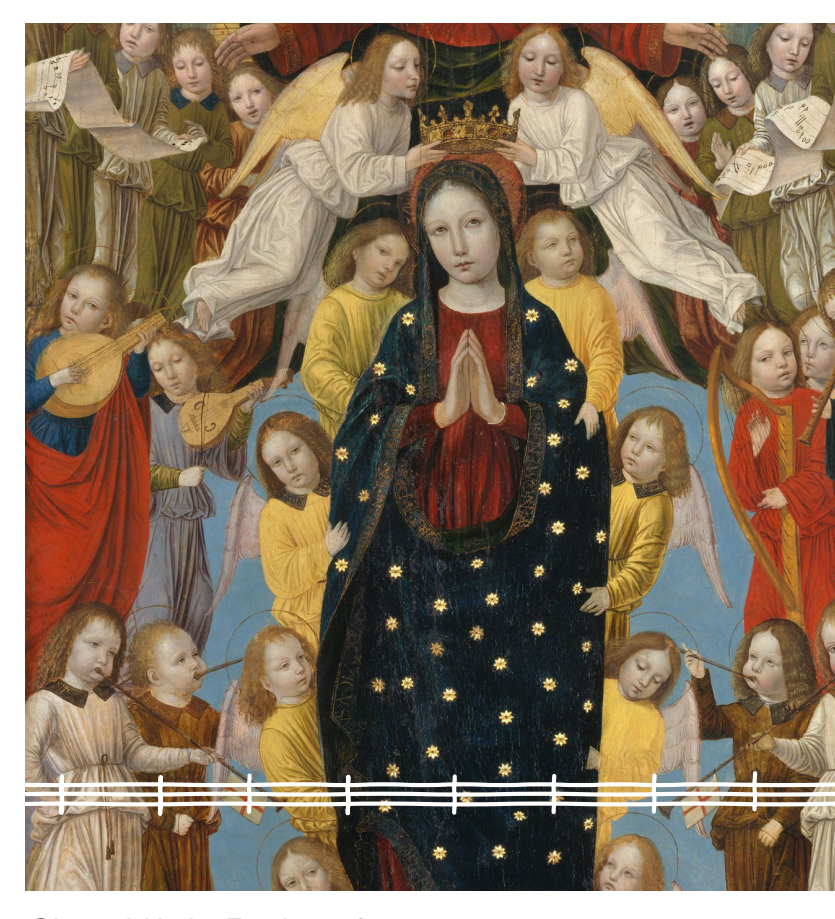
Choral Holy Eucharist The Festival of Mary the Mother of God 14 August 2022 at 11am