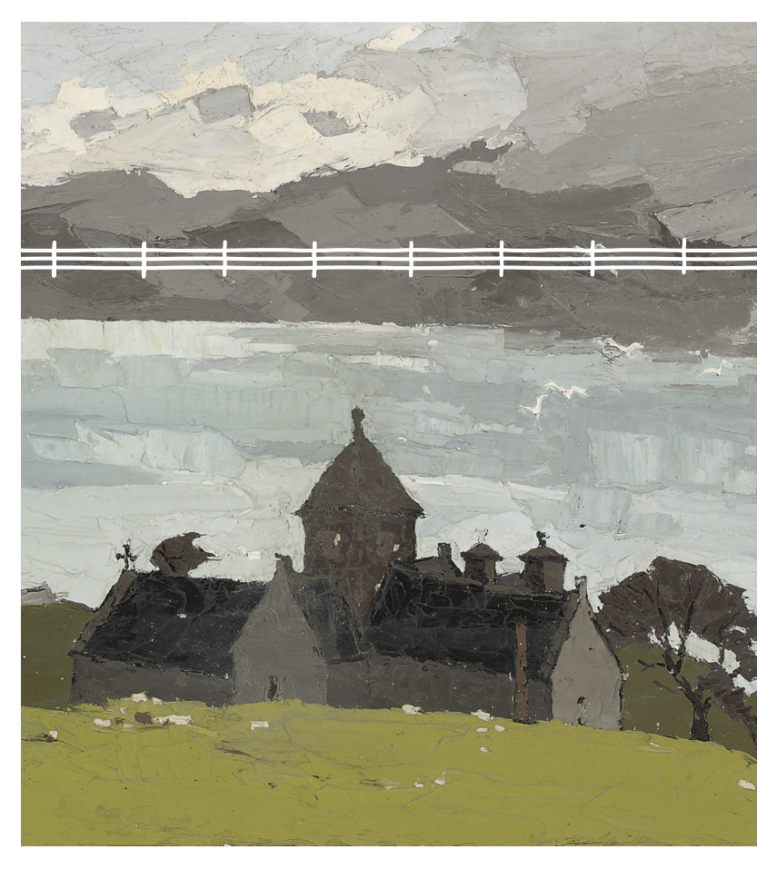
Choral Holy Eucharist The Saints of Wales's Day 6 November 2022 at 11am