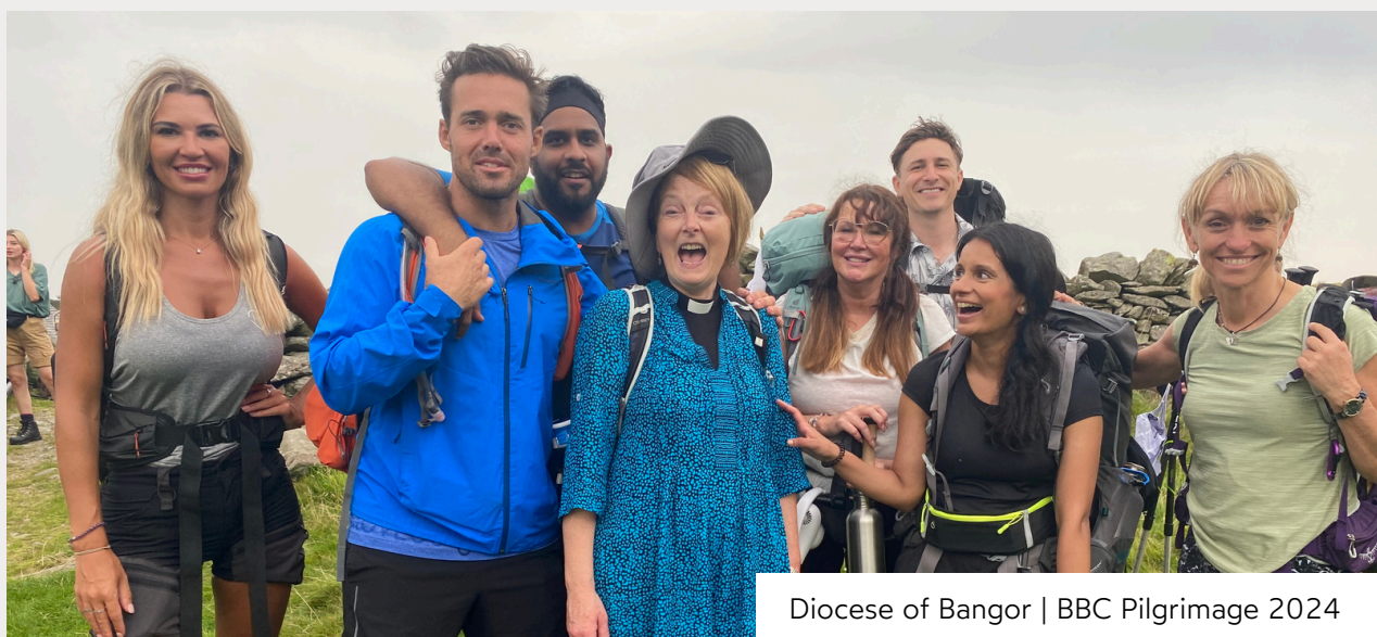
Diocese of Bangor | BBC Pilgrimage 2024

We welcome you to join us in this transformative mission, as we navigate the challenges of our time with faith, dedication, and a commitment to worship, growth, and love.